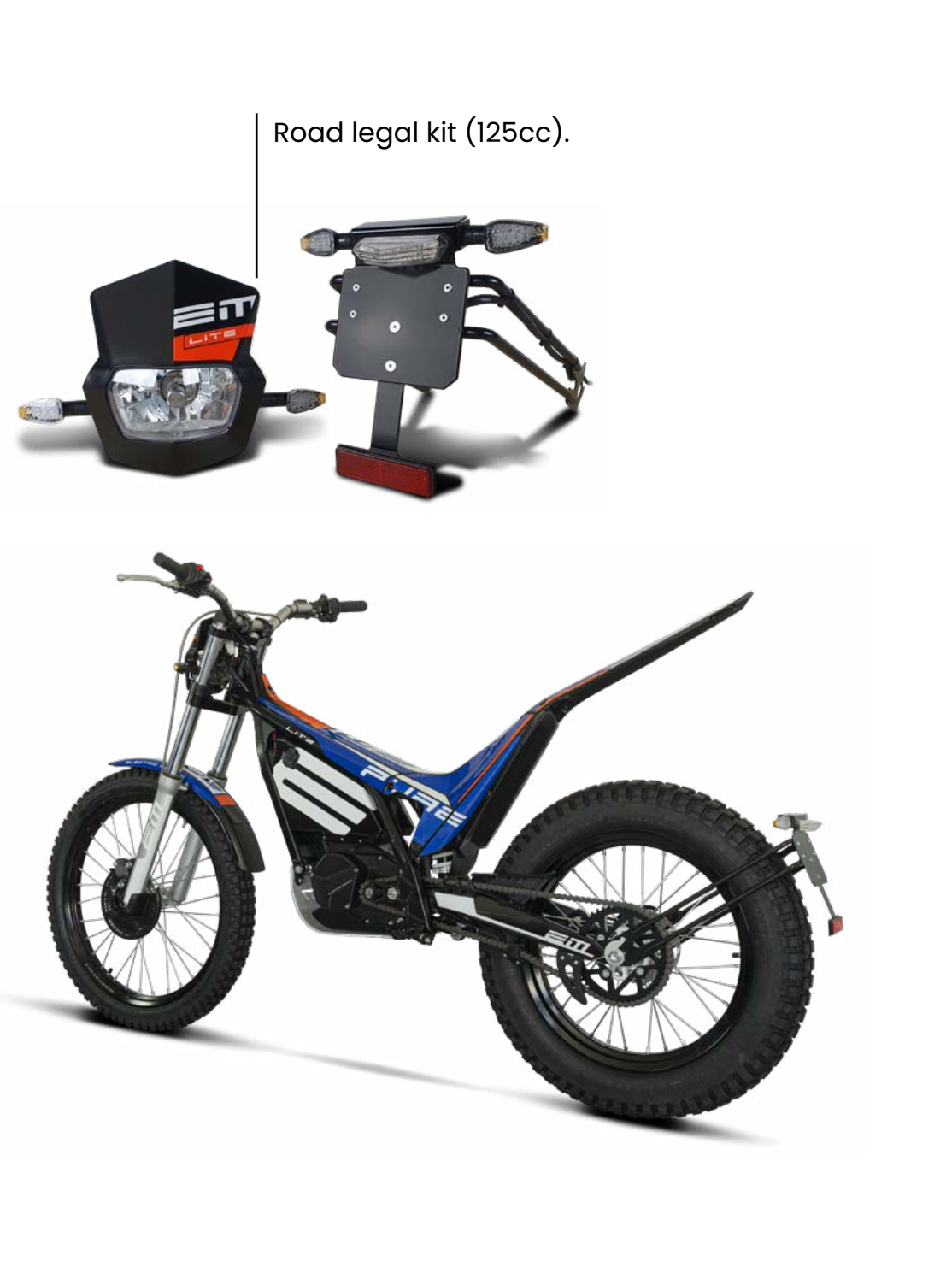
Road legal kit (125cc).