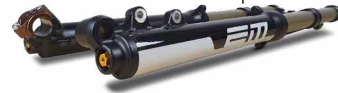
Aluminium Racing Tech® fork