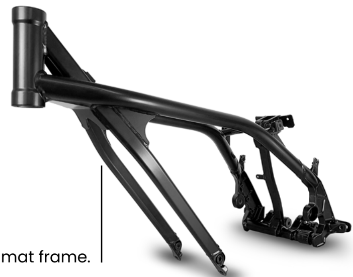
Black mat frame.