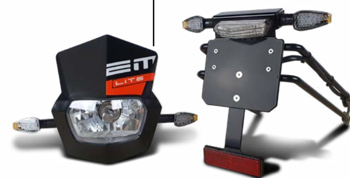
Road legal kit (125cc).