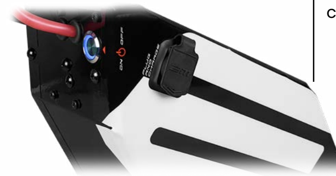
Battery with new charging socket cover.