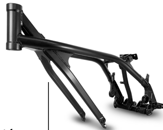
Black mat frame.