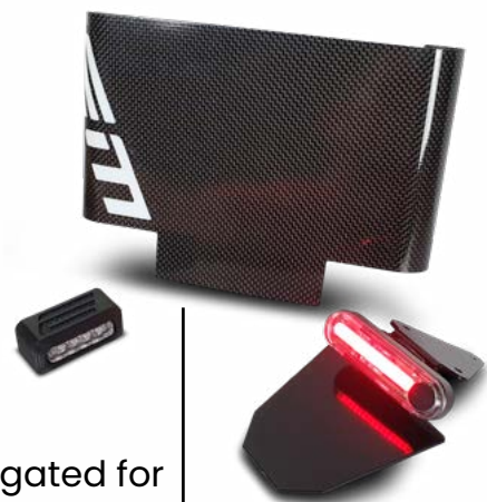
LED kit : not homologated for road use (option).